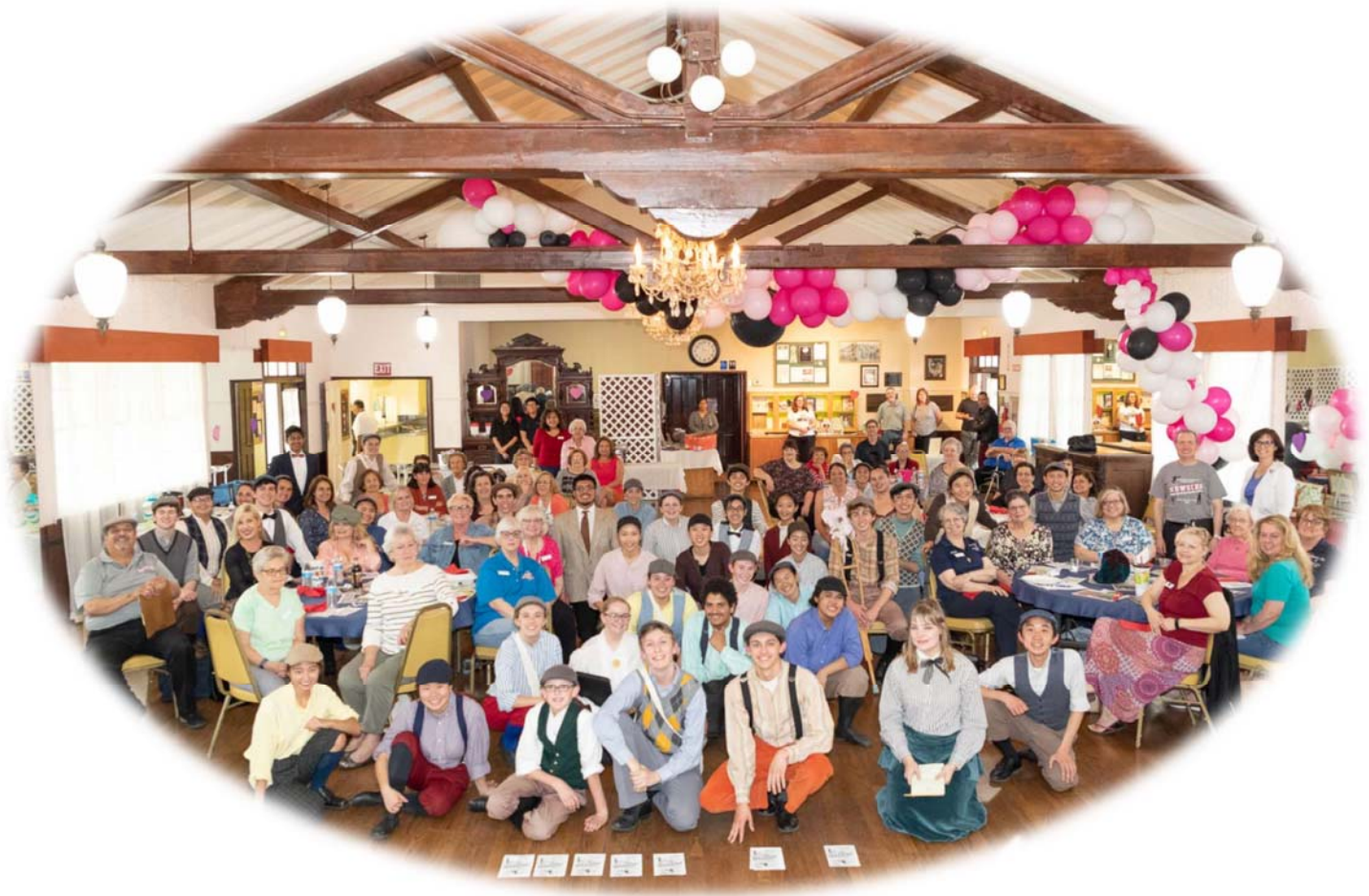
February 22nd Camellia Parade