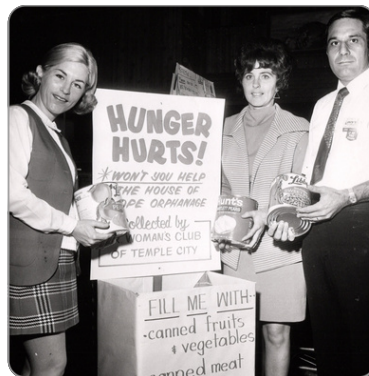
Published on November 19, 1969. The Temple City Woman's Club was collecting food for the House of Hope Orphanage.