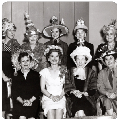
The title was "Hat Contests Were In Style" It was published in Temple City Times Society Section on May 17, 1970.