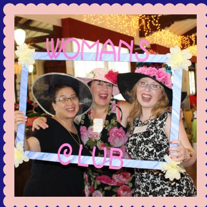
GENERAL MEETING SEPTEMBER 9TH