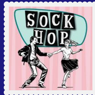
GENERAL MEETING SEPTEMBER 23RD